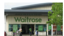
Waitrose & long stay car park